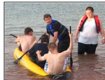
Crossroad Students successfully load the kayak and head out to the island.

return to the point of entry while keeping time. They competed against a clock, themselves and each other. These men faced the decisions of whether to pick up the smallest amount of trash possible quickly, or to spend some time bettering the environment and picking up larger amounts of real trash. They faced the issue of dealing with each other's different strengths. They asked themselves, "Do we leave behind the ones we don't think perform or do we assimilate, teach, and motivate them to achieve their excellence?" After racing against the clock, they learned that they need each other, they need communication skills, and that they need to curb competition when building a community base.