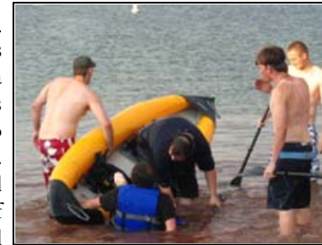
Crossroads students make a first attempt at loading the kayak.

pressure removes the weak parts of us if we allow it. Last week a group of men in the Crossroads Leadership program were able to experience this for themselves. This experience designed specifically to cut through all of the weak parts of these men and leave exposed their strong parts. We described the difference between excellence and perfection. Perfection was not the expectation but excellence was. I don't believe perfect is as important to our growth as excellence is. These great young men participated in a Kayaking adventure with three distinct purposes. First they were to work as a four man team. Second they were to row to an island in the reservoir with out losing any member of their team. Third they were to pick up trash on this island left behind by others and