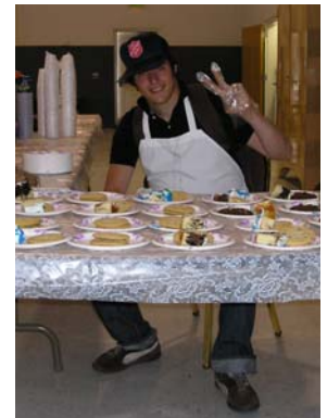
The Dessert table